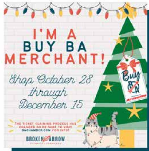
Social Media Merchant Graphics